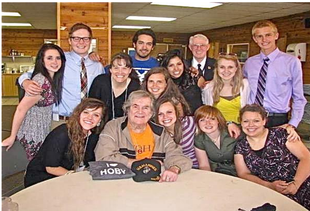
HOBY Utah visit

I do NOT believe we are all born equal – CREATED equal in the eyes of God, YES – but physical and emotional differences, parental guidance, varying environments, being in the right place at the right time, all play a role in enhancing or limiting an individual’s development. But I DO